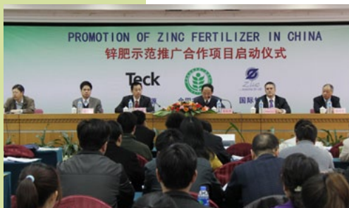
IZA-MoA Workshop in Xiamen, March 7, 2012