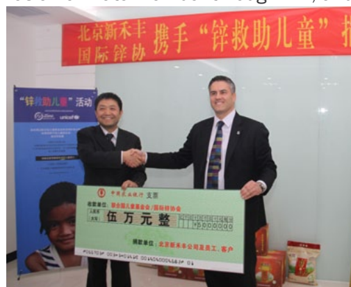
Donation ceremony at Xinhefeng, March 9, 2012

Xinhefeng is a major micronutrient fertilizer producer and retailer in China and has been a member of ZNI since 2010.