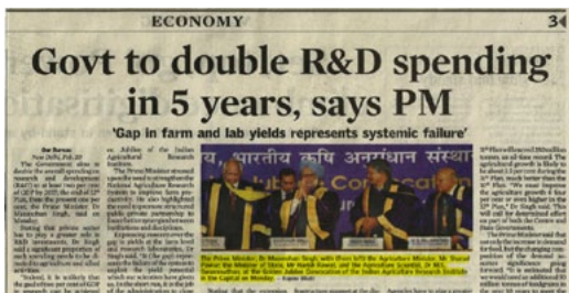
Media release of Indian Prime Minister's address at IARI, New Delhi

Dr. Manmohan Singh, the Prime Minister of India, addressed a gathering of about 2000 participants on February 20th. He pronounced his concern about the challenges of malnutrition prevailing in the country, saying: